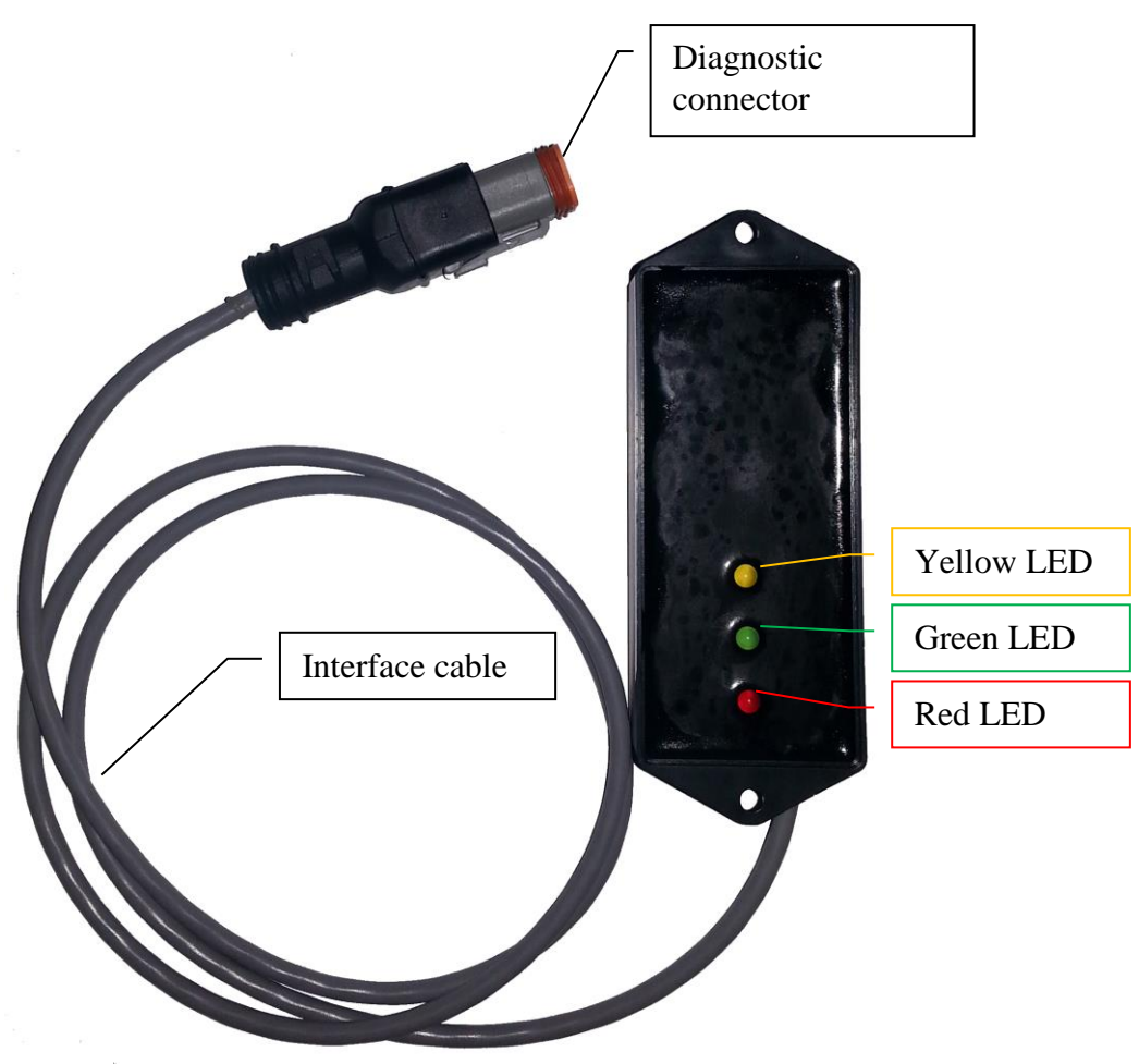
Table 1: The Status LEDs indicate power, communication, and calibration status.

CMI (Control Module Interface) Lite is a hand-held service tool for EFI-equipped Buell<sup>™</sup> motorcycles. This tool allows the user to read ECM historic trouble codes, clear historic codes, check the idle position, and reset the Throttle Position Sensor. The tool uses the standard diagnostic port to communicate with the ECM.